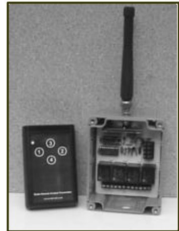
Cased Receiver and Four-Button Transmitter

Apply power and check that the red status LED (1) blinks every 1/2 second. This indicates that the board is powered, 'healthy' and is operating correctly.